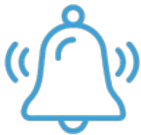
Targeted Action Alerts

Social advocacy requires organizations to employ social sharing and networking sites to advance your advocacy campaigns. Social media can be used to reach out to advocates and alert them of your activities and to reach out directly to your representatives about your mission.