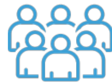
Share Supporter Involvement

There are three primary ways that your nonprofit can use social media for your advocacy campaigns: