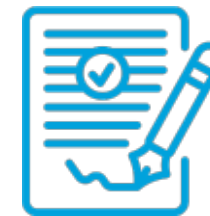
Signing is fast

A petition is a request for representatives or legislators to do something in support of your organization’s mission. Your nonprofit collects signatures from your supporters to strengthen the voice of the request.