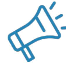
Strengthens your voice